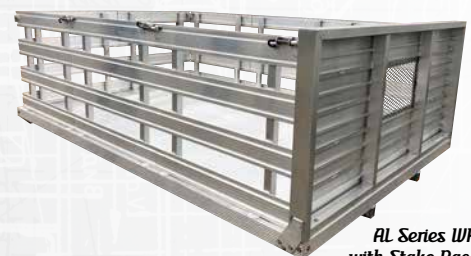
AL Series WHII with Stake Racks