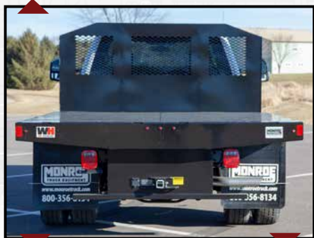
FMVSS Compliant Lighting & Rear Rubber Mud Flaps