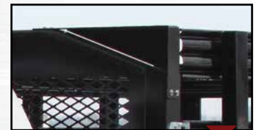
Optional Bulkhead Filler Panel