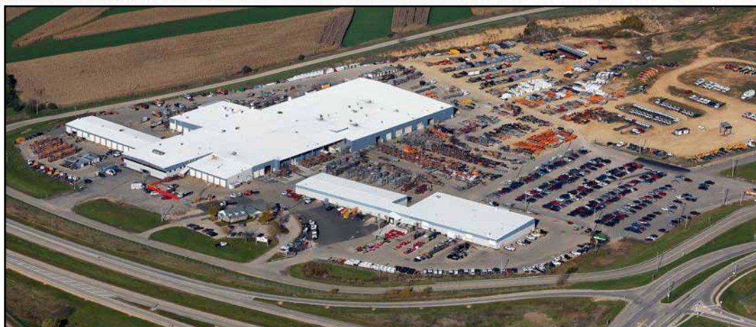
MTE Headquarters - Monroe, WI