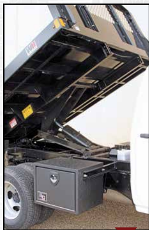
Optional Double Acting Hoist and Underbody Toolbox