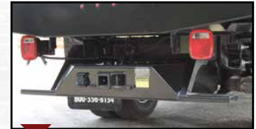
Optional Swept Back Hitch