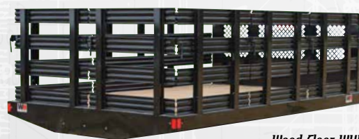
Wood Floor WHII with Stake Racks