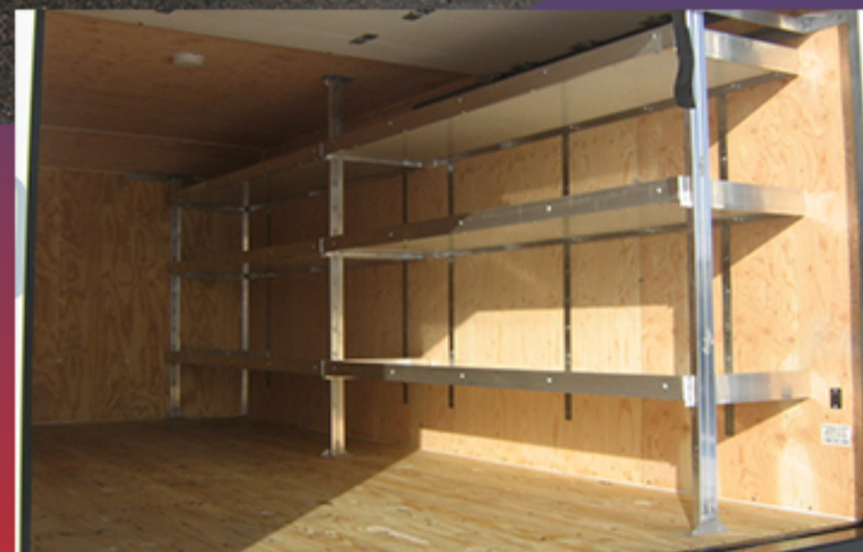
Interior Shelving Options

LED Backup Marker and Stop/Turn/Tail Lights