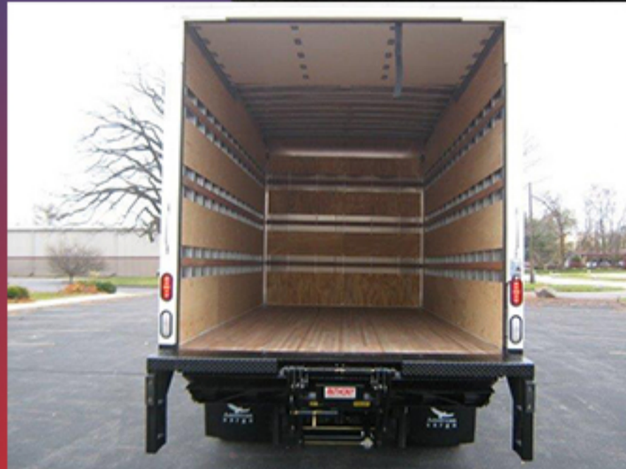
Liftgate & Cargo Control

Powder Coated Galvanized Steel Rear Door Frame