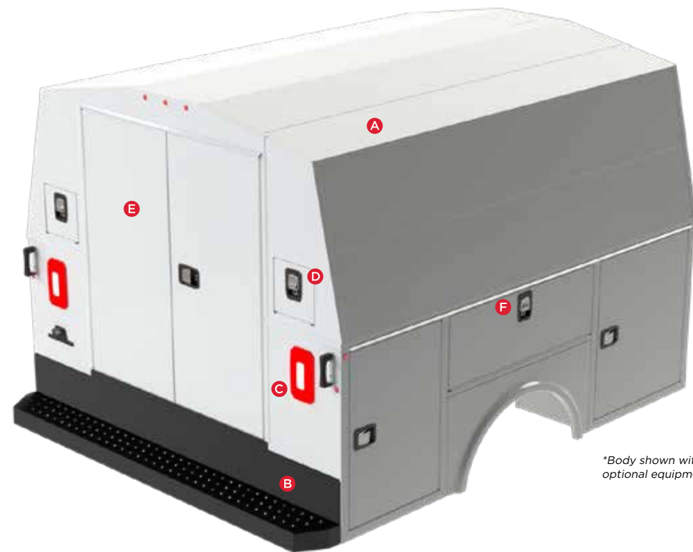
*Body shown with optional equipment.

make opening and closing easy, providing access to spacious side compartments