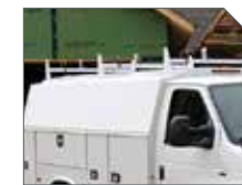
3 BOW LADDER RACK