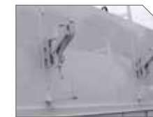
SIDE MOUNT LADDER RACK