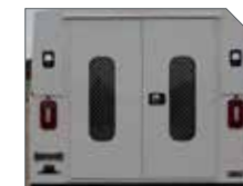
REAR DOOR WINDOWS