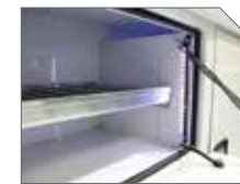
LED COMPARTMENT LIGHTS