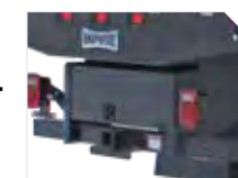
CLASS V RECEIVER HITCH WITH ICC BUMPER