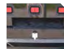
UNDERBODY STORAGE COMPARTMENT