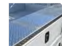
ALUMINUM TREAD PLATE TRIM