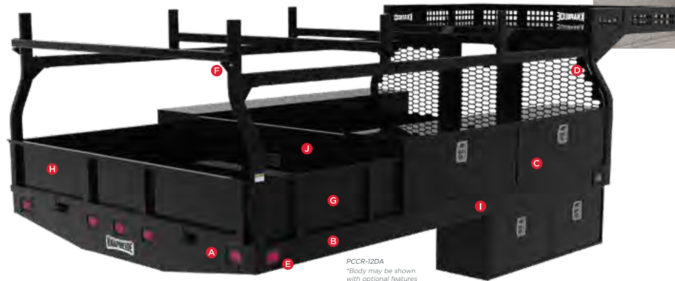
PCCR-12DA *Body may be shown with optional features

Visit knapheide.com/quote and fill out the form to receive a quote and additional product information.