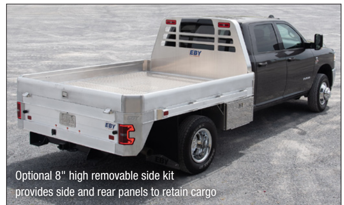
Optional 8" high removable side kit provides side and rear panels to retain cargo

EBY mounting kits are provided with each body