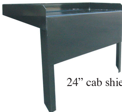
24" cab shield

All Godwin bodies are constructed of 10 gauge ASTM-A 607 grade 50 material or equal to ensure durability and long life. Godwin leads the industry with standard thermoset Zinc primer under black thermoset Powder coating. A 24" cab shield is standard equipment on the 300U and 300T.