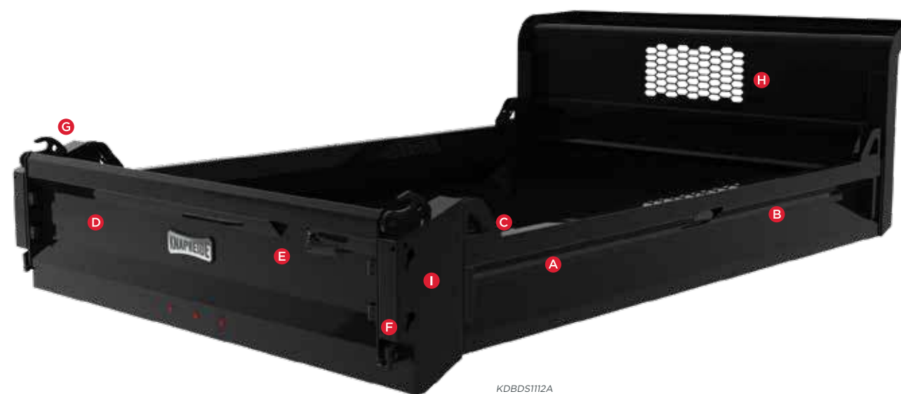
KDBDS1112A *Body may be shown with optional features

constructed of 10-gauge high tensile steel with a punched window for visibility