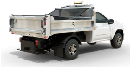
Z-DumpPRO® | Elite