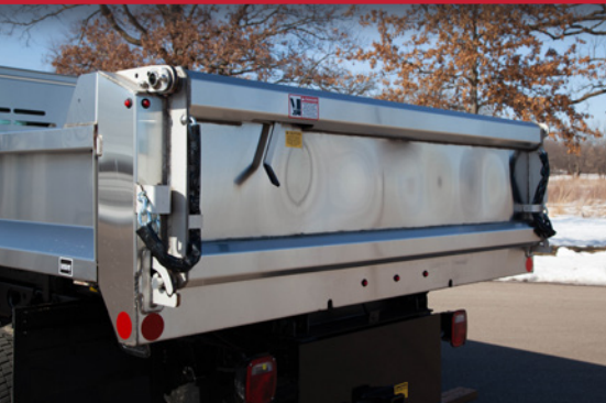
Quick Drop Tailgate