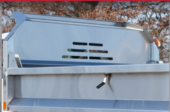
Bulkhead with Window