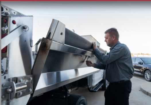
Fold Down Sides