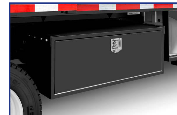
Tool Box (sizes available may vary)