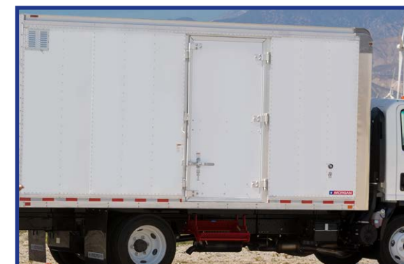
Side Door and Step Options Available