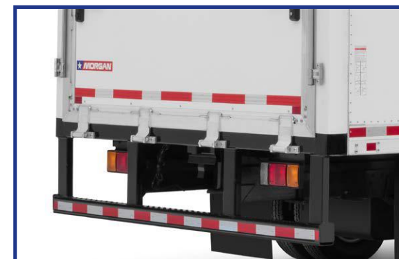
Morgan Standard Full Width ICC Bumper

Morgan innovation changed the van body industry when they produced a body that is aerodynamic in design, featuring patented poly-tuff corners and a reinforced front-end.