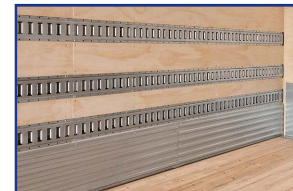
Various Cargo Control and Scuff Plate Options