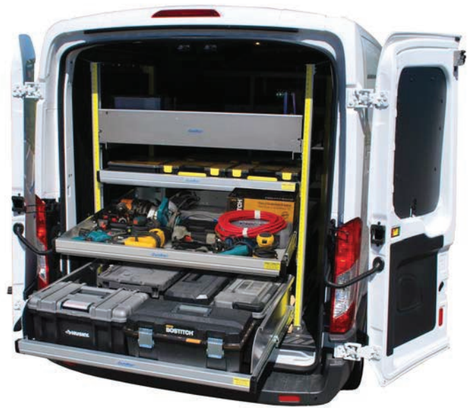
Full DuraRac with standard, 6" & 10" shelves and sliding Interior Workstation. Maximum number of shelves vary based on application.