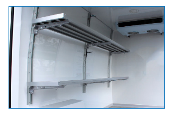
Aluminum fold-down shelves