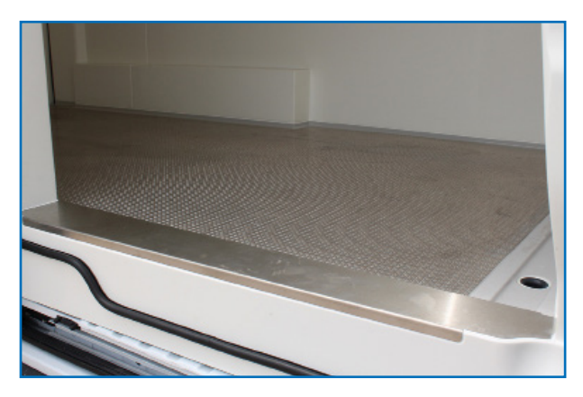
Stainless steel doorstep protection