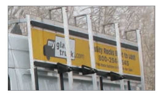
Sign panel with graphics