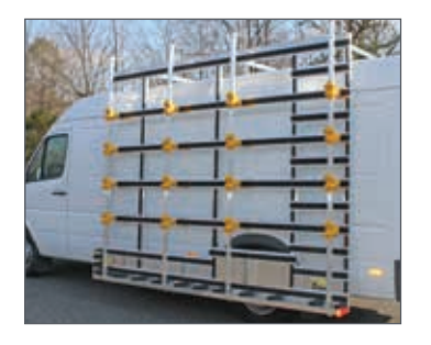
Slat ladder for easy access to optional roof rack