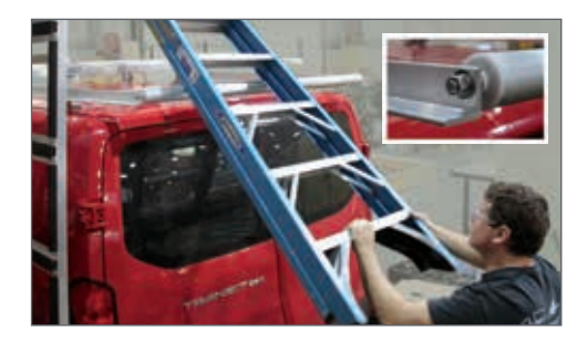
"Load-EZ" roller bar assists with loading to roof rack