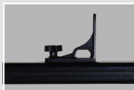
Cargo Stops for Accessory Glide Track