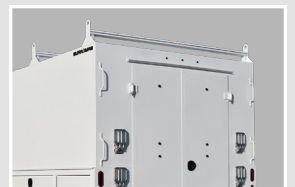
HD Ladder Racks (Equipped with Accessory Glide Track)