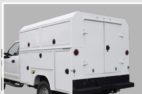
Tapered Side Canopy