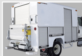
Lift Gate with Canopy Service Body