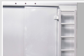
Full Rear Ladder