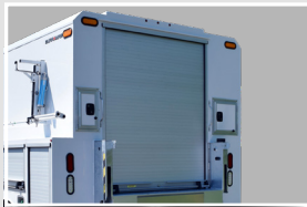
Roll-up Rear Door