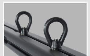
D-Rings for Accessory Glide Track