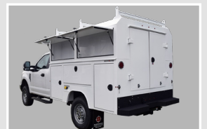
Canopy Side Doors