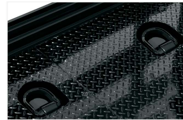
Floors Also Available in Metal