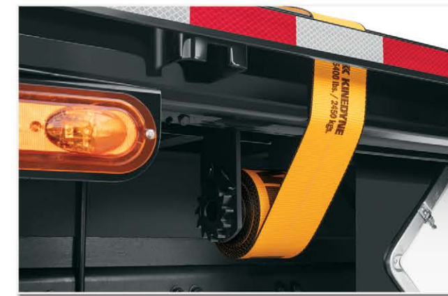
Various Cargo Controls