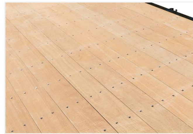
Apitong wood floor provides the durability and strength you need to transport heavy loads...and load and unload product quickly and efficiently...again and again