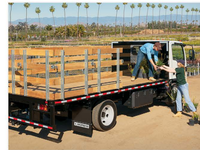
Racks Available in Wood or Metal