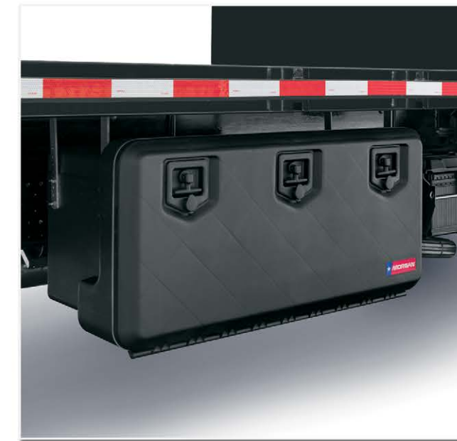
Metal and Polypropylene Tool Boxes