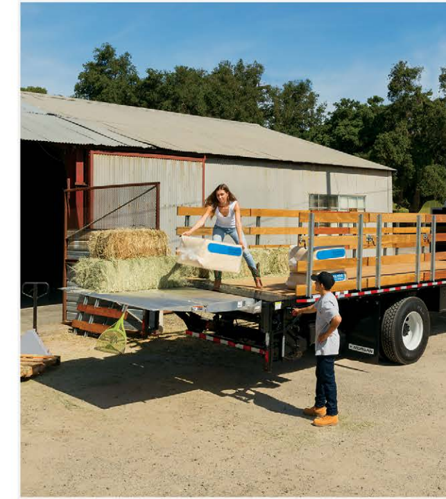
Variety of Bumper and Liftgates to Make Any Delivery Fast and Efficient