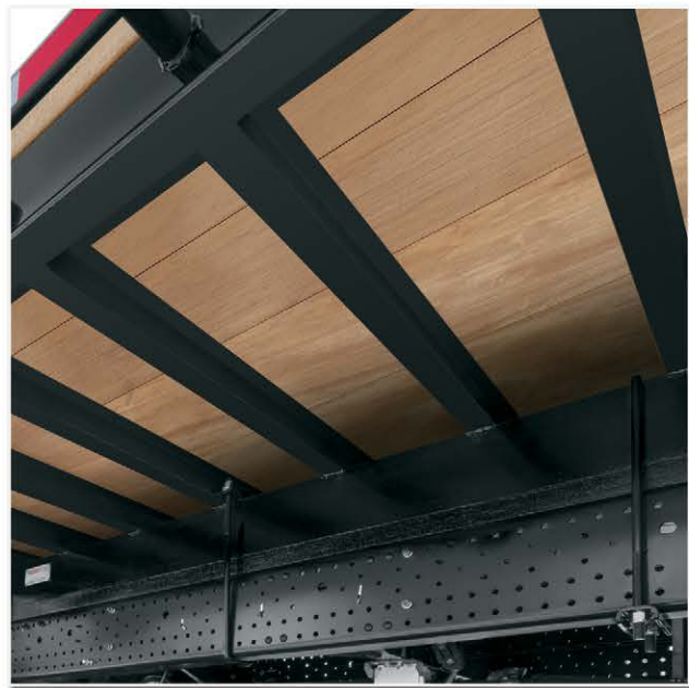
The Prostake's Steel Undercarriage Provide The Durability And Strength You Need To Transport Heavy Loads