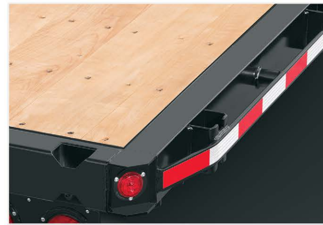
Our unique rub-rail design provided added protection