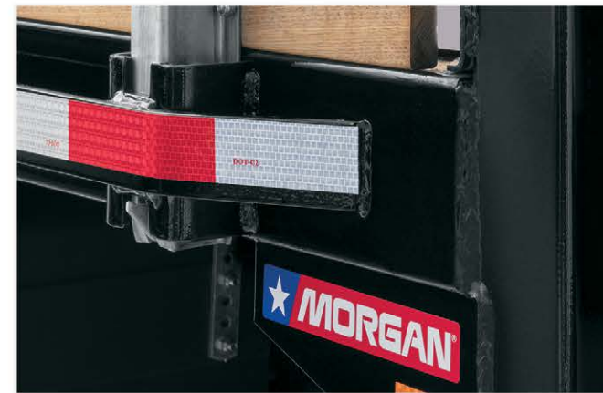
Racks fit snugly into deep stake pockets to secure your load during transport; but allow easy removal for unloading