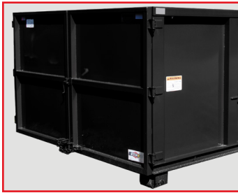
Available in Single Swing or Barn Doors