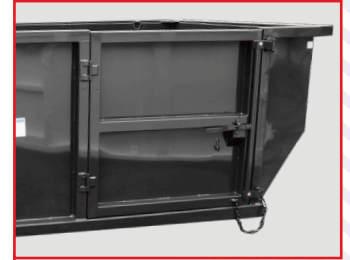
Curbside Door (optional)