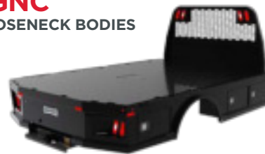
// PGNC GOOSENECK BODIES