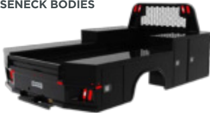
// PGND GOOSENECK BODIES