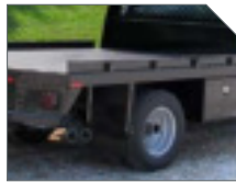
4" REMOVABLE SIDE BOARDS