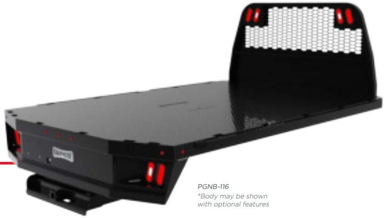
PGNB-116 *Body may be shown with optional features