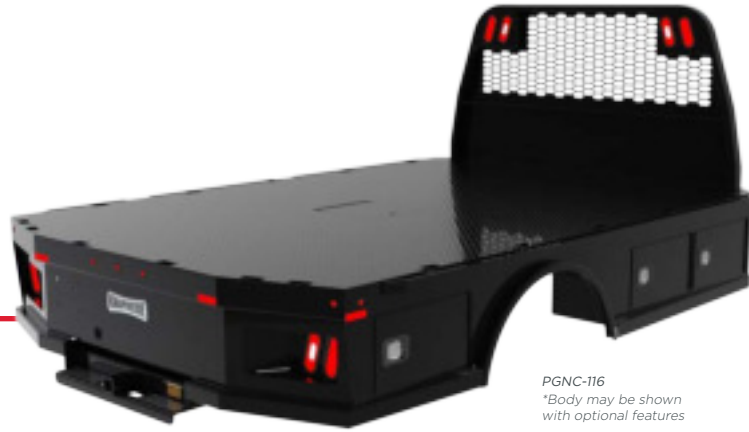
PGNC-116 *Body may be shown with optional features