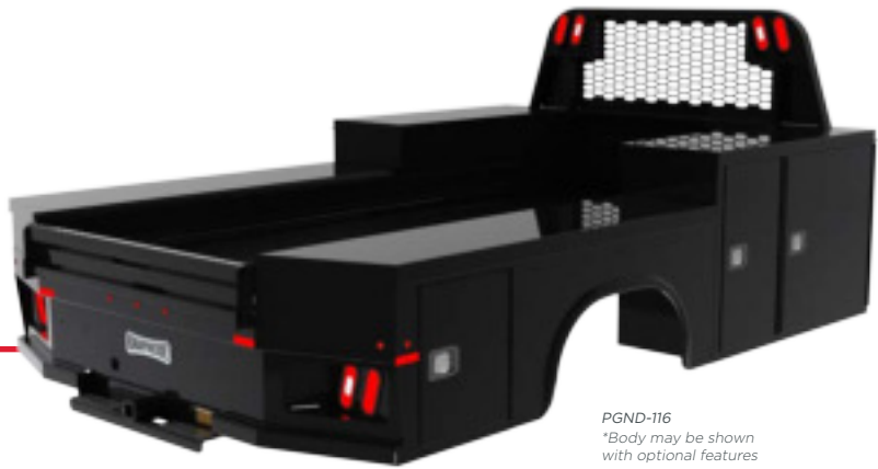
PGND-116 *Body may be shown with optional features