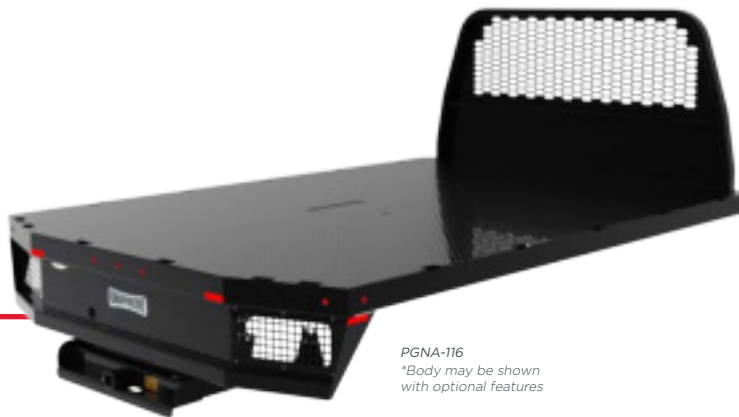
PGNA-116 *Body may be shown with optional features