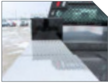
ADDITIONAL ALUMINUM TREAD PLATE OVERLAY