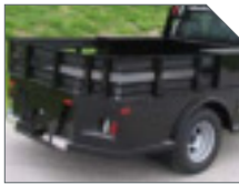
ROUGHNECK CONTRACTOR PACKAGE