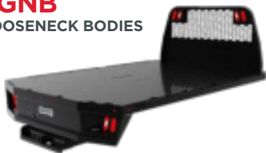
// PGNB GOOSENECK BODIES