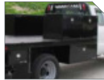
ABOVE BODY AND UNDERBODY TOOLBOXES