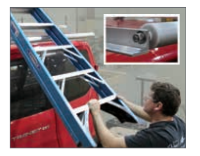
"Load-EZ" roller bar assists with loading to optional roof rack