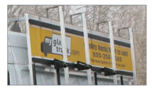
Sign panel with graphics