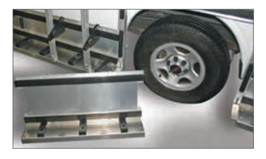
Removable wheel skirt for hassle-free tire changes