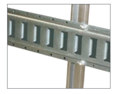
E-track cargo control system